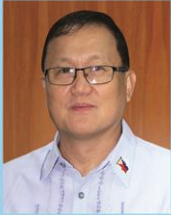
SEC. EDUARDO D. DEL ROSARIO Chairperson Housing and Urban Development Coordinating Council